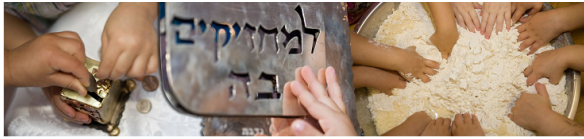
Moriah Early Childhood Center